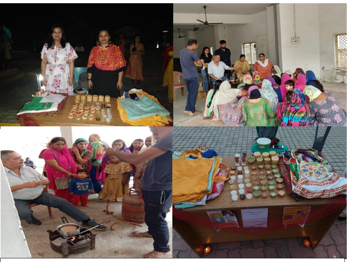
Students and members of REEDS organisation catering to the rural folk in Fatehpur.

Helping hands (group 1) has taken up the integrated rural village development project. The team has adopted Fatehpur village. The problem they initially identified is the unemployment of rural women. The team along with REEDS imparted basic training to the women providing them skills to make products that will come in use during the festive time of Diwali.