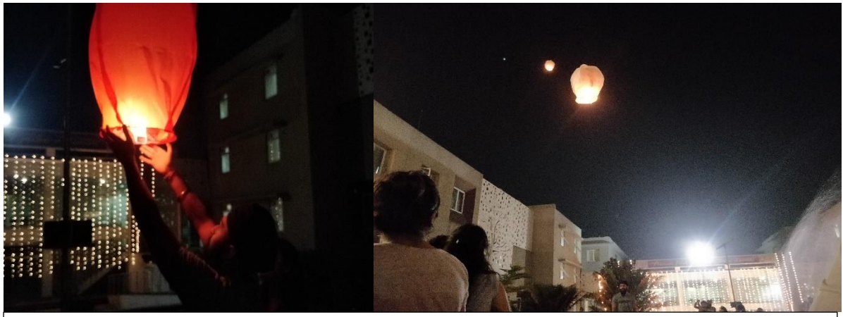
Students engage in multiple activities during the festival.

Mansimran won first position and her Rangoli was the one on the basement porch and the team comprising of Shyna , Surbhi and Swati won 2nd position, their Rangoli gracing the boy's hostel porch. The event was a success and the creativity of the students had everyone excited to grace the occasion of Diwali and celebrate the values of the Festival of lights.