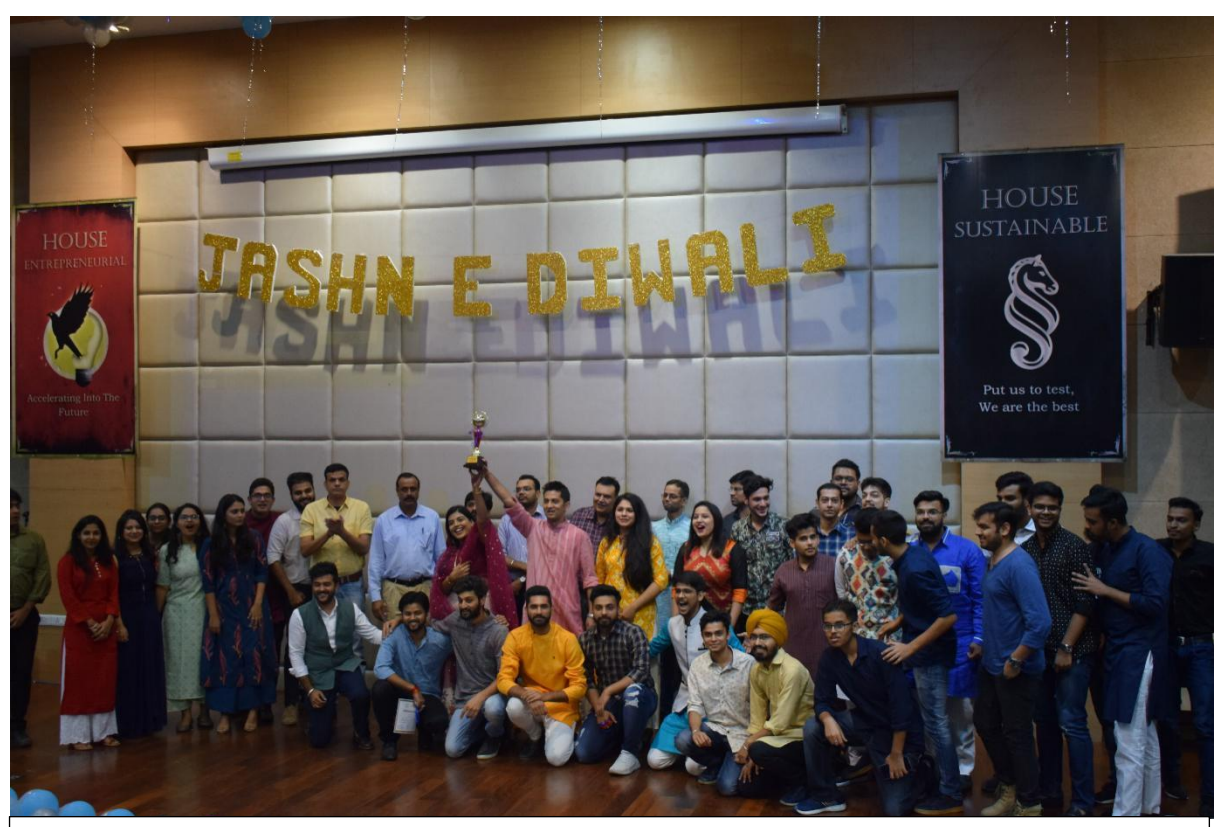
Members of House Entrepreneurial celebrate with the trophy after emerging victorious in Sports Competitions.

House Entrepreneurs emerged as the overall winners of the sports meet and were presented with the trophy to appreciate the efforts of the house Members.